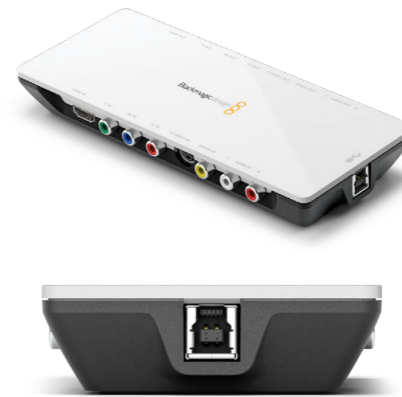
New USB 3.0 For highest quality 10 bit SD and HD!

HDMI™ Direct HDMI Connections Connecting to cameras and digital set top boxes via HDMI for the highest quality. Get incredible quality video from cameras by capturing direct and bypassing the compression chip for professional quality video captured direct from the image sensor. As editing software can't play back to AVCHD and HDV cameras for monitoring, Intensity is ideal to use for monitoring edits with real time effects on the latest big screen televisions and video projectors by connecting to the built in HDMI out.